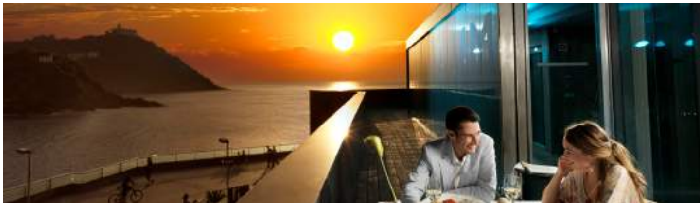
Dinner at Bokado Restaurant