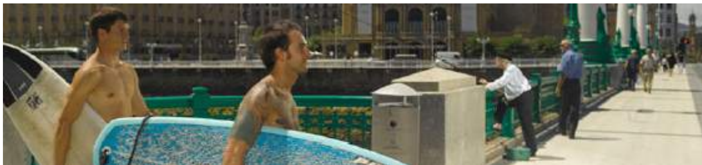
Surfers at Zurriola beach